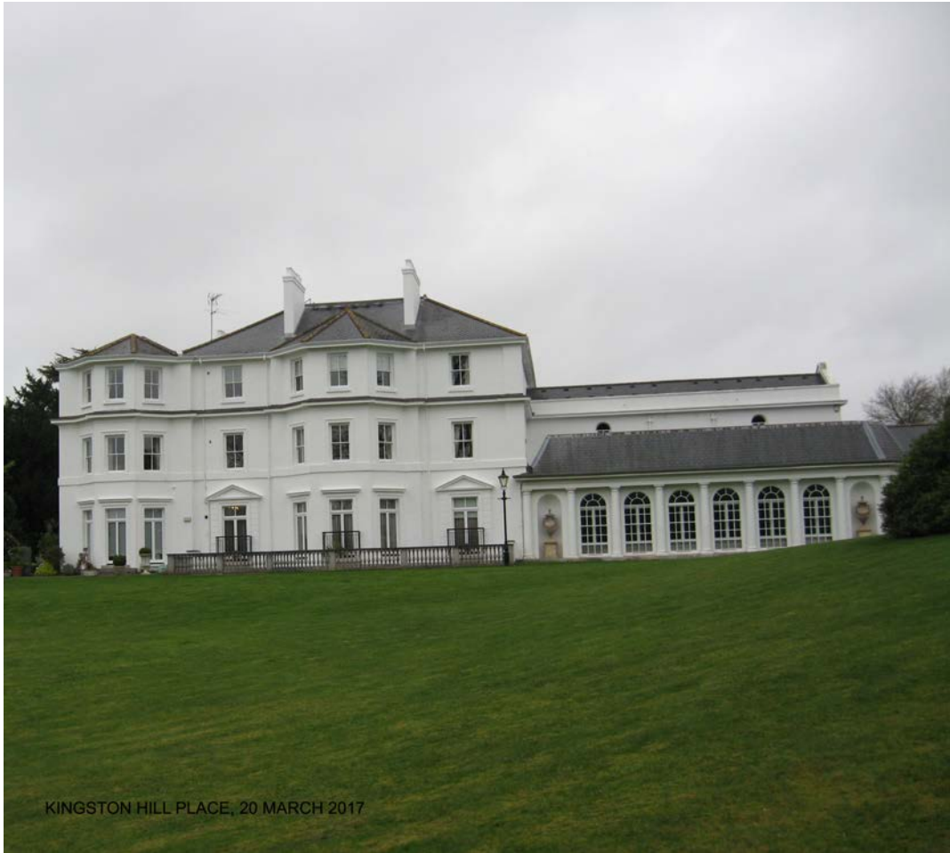
Figure 1, Photograph of Kingston Hill Place, 20 March 2017